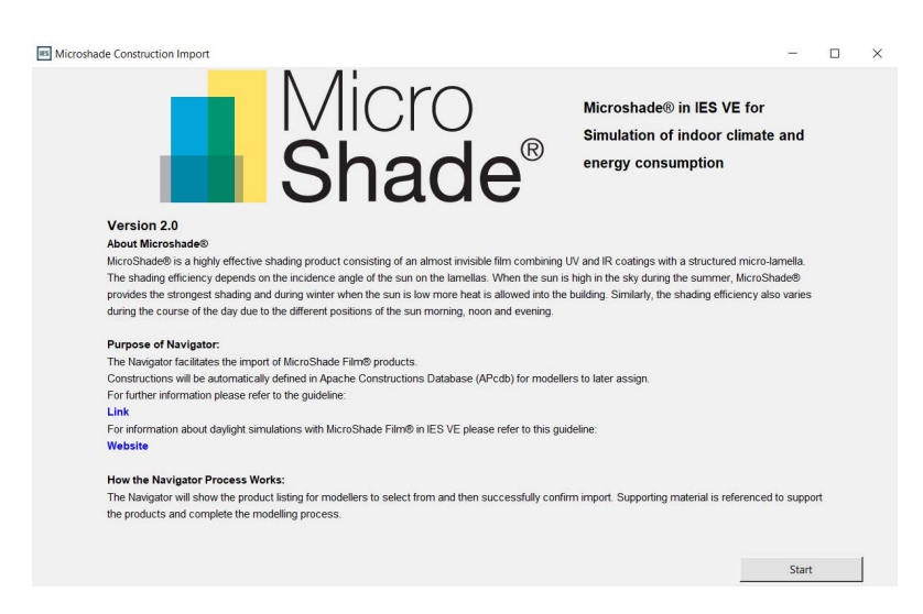
Figure 3: MicroShade® Importer start page.